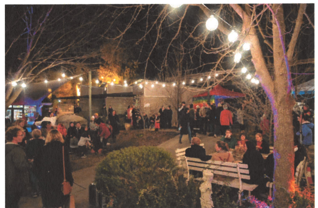
Over 1200 people visited our Winter Festival event Fired Up! In August 2021.

Several successful events were held in 2021. Our Market events program continued to gain strong interest with three markets held over the year. Each market affords our member makers real retail opportunities and exposure to an appreciative audience and adds vibrancy and activity to our facility. Several of our studio tenants took part in the annual TACA Open Studios with artists reporting strong visitation and studio sales. The stand out event for the year was our inaugural Winter Festival: Fired Up . Assisted by funding from the ACT Government's Winter Events Fund we welcomed over 1200 visitors to our facility for an evening of demonstrations, markets, performance, food and live entertainment.