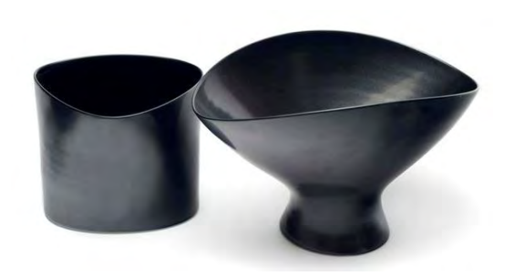
Living Treasures: Masters of Australian Craft Prue Venables Australian Design Centre 1 August - 25 September