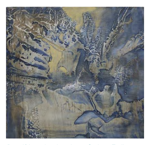
<u>Dryad/Hamadryad</u> continues Graham Eadie ANCA 28 August to 15 September. Opens 28 August at 6pm

August 15 to September 1 21 Blaxland Crescent Griffith, Canberra Open Wednesday to Sunday 12-5pm