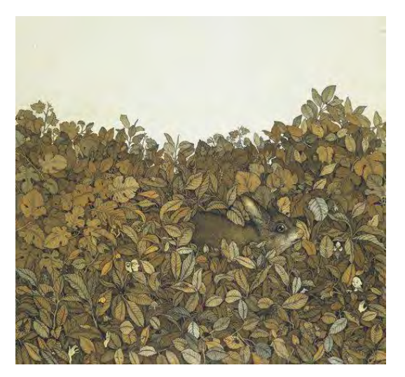
Kyoto Wanderings, Place Less, Invasive, Abstracting Space and Our City.

August 15 to September 1 21 Blaxland Crescent Griffith, Canberra Open Wednesday to Sunday 12-5pm