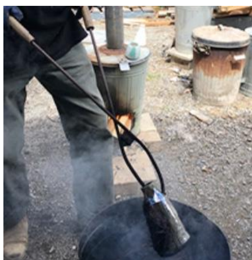
Raku Firing, Open Day 2016

Canberra Potters at Watson Arts Centre will throw open its doors and welcome visitors for a day of ceramic arts activities and fun. It's an opportunity to find out what goes on in Canberra's only ceramic focused Key Arts Organisation. Be sure to visit our Makers' Market to find a perfect handcrafted treasure.