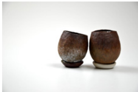
Two comfort cups with worry stones