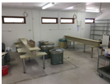
Transformation: Two Studios become one Workshop