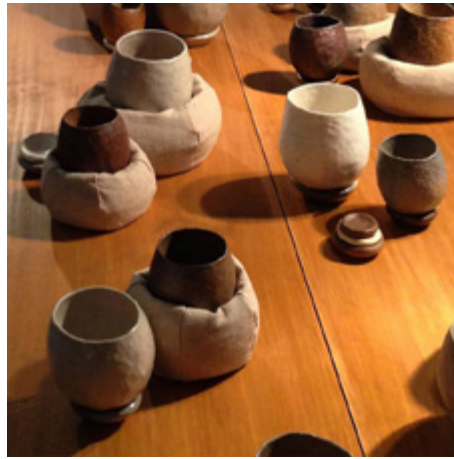
Pieces from Raw Verse , 2016