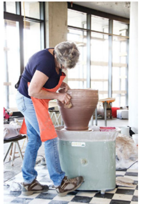
Maryke throws big

For more information visit www.sodafiringchina.com