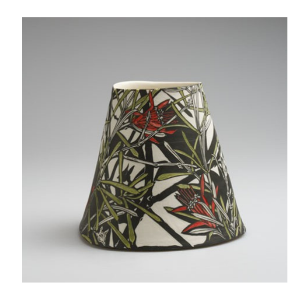
Image: A visit to the river, porcelain, 2018.

Only four days to go! If you haven't seen this exhibition yet you still have time. If you have seen it—go again!