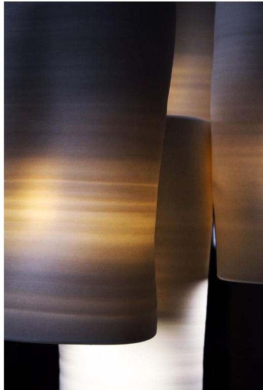
Image: Cone11 Porcelume Ripples 1.5 lighting detail COTA