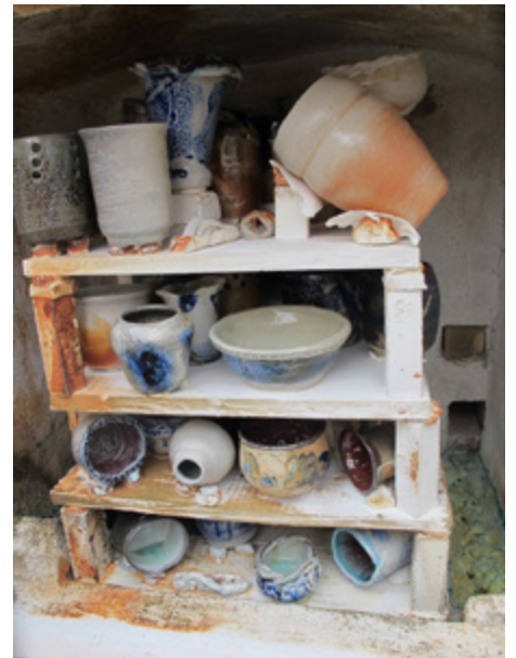
Satisfying results from the first soda firing