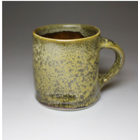
Rob Linigen, Mug with weed ash glazes, oxidation firing.