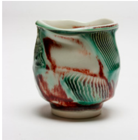
Rob Linigen, porcelain cup with glaze that includes salvaged copper, quartz and wine glass bottles. Electric kiln.