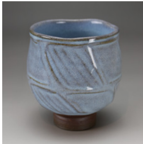
Rob Linigen Stoneware cup, Chun style glaze includes ash, salvaged quartz and chicken wishbones. Gas reduction firing