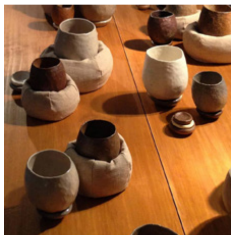
Pieces from Raw Verse , 2016.