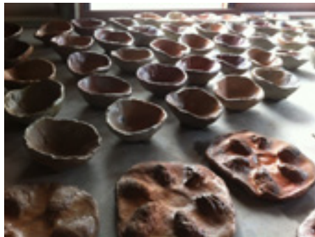
Knee bowls and oyster dishes.