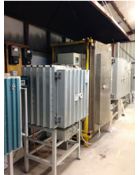
CPS electric kilns.

We have recently had a backlog of work to be fired due not only to the sheer volume of work coming through but also having a couple of kilns out of action. This has now been remedied — kilns 3 and 4 are now in working order.