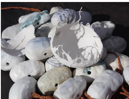
Homing—Combined artists' works

Opening 7pm Thursday 2 July Each artist has interpreted ideas of homing through the fragility and resilience of porcelain bringing their own stories and practice to create a connected work, that encourages the viewer to contemplate their own sense of home.