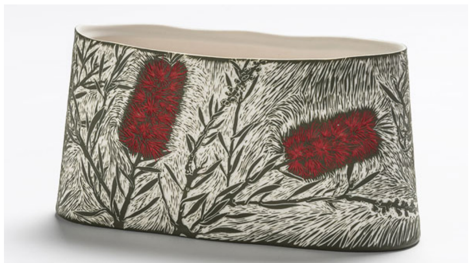
Cathy Franzi Crimson Bottlebrush porcelain, wheel-thrown, engobe, sgraffito, red glaze

In contrast, in order to convey the large variety of forbs that can be found in a floristically diverse native grassland site, Franzi has used Limoges porcelain and developed an engobe (a slip with low clay content) with a vitreous glaze that is coloured to achieve a dense effect with a low sheen. This provides the background necessary to contrast the sgraffito technique conveying the structure of ascending delicate multiple flower stems. Franzi made her own tools to achieve the effect she wanted in either a positive or negative space. The techniques Franzi developed allowed her to show the willowy stems, slender erect flowers, sparse droopy papery leaves, flowers