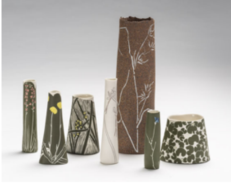
Cathy Franzi Natural Temperate Grasslands porcelain, stoneware with porcelain inlay, wheel-thrown, engobe, sgraffito, glaze

with membranous wings, miniature spikes or complex hemispherical flower heads that are some of the characteristics of local forbs or wild flowers. This includes Scrambled Eggs, Yellow Buttons, Yam Daisy and Silky Swainson-pea.