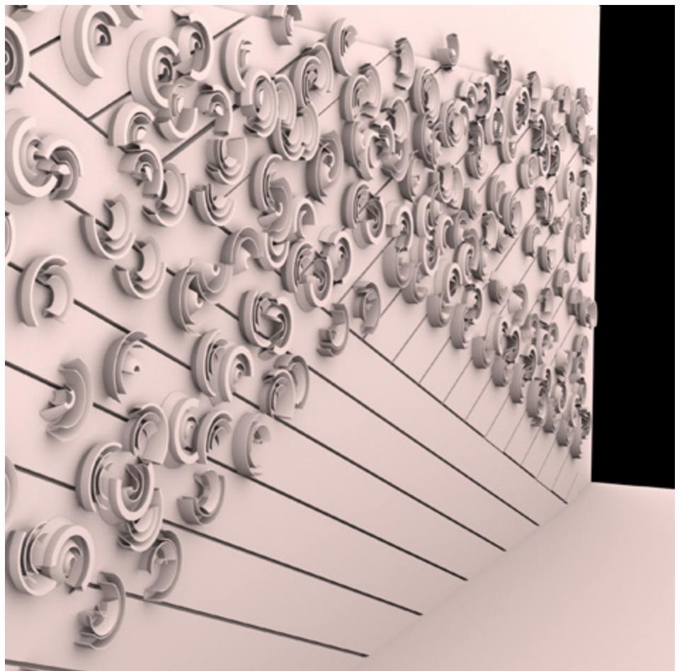
Lane Cove Proposal 2, prototyping ceramic tiles, Raj Reddy 2016