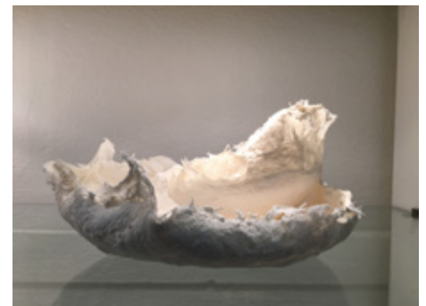
Jo Victoria: Imperial porcelain 25 x 30 cm appx.