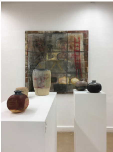
Heidi Strachan: beeswax, oil paint, pigments, clay.