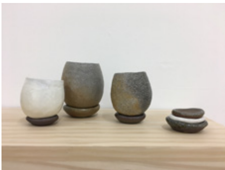
Abbey Jamieson: hand pinched, soda fired stoneware 9 x 8.5 x 8.5 cm appx.