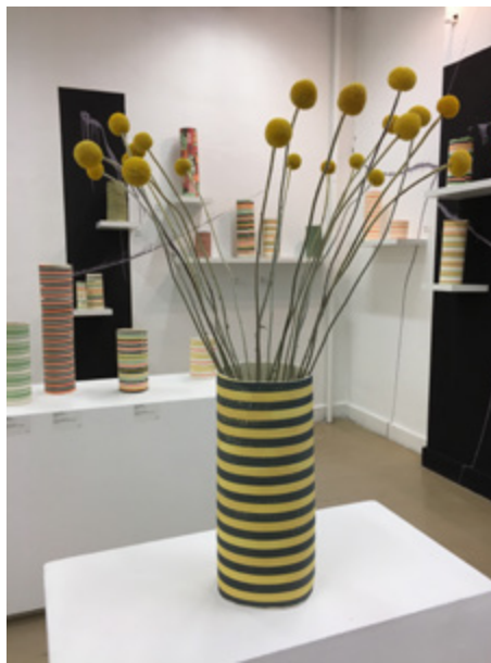
Gemma Simpson: stoneware and porcelain slip, stain, various dimensions.