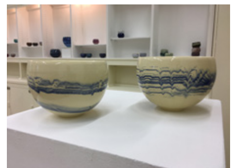
Katrina Leske: wheel-thrown earthenware clay, cobalt decoration, clear glaze 18 x 23 x 23 cm.