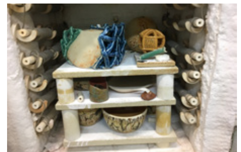
Finished works in the kiln; .