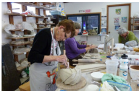
Participants hard at work