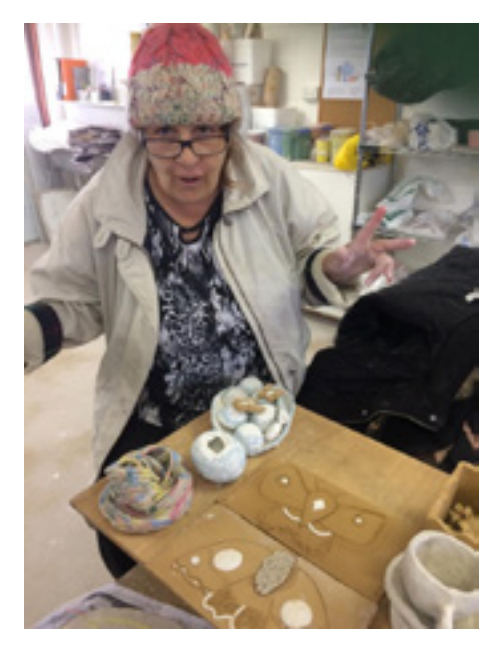
More images of the students from the Yurauna Centre at CIT.