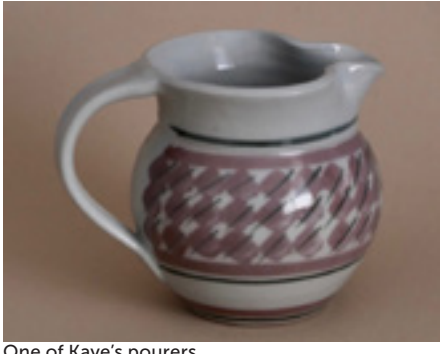
One of Kaye's pourers

Watch out also for details of Kaye's January offering on lidded forms.