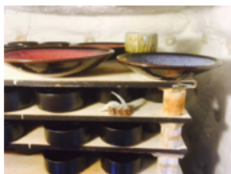
Gas fired kiln showing reduction-glazed work