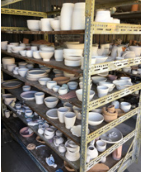
Do any of these pots look familiar? Rescue them now.

A less appealing part of the job is the regular destruction of uncollected work. The trolley load of work pictured is due to be destroyed in the next couple of weeks. Is your work on this trolley? Please pick it up ASAP.