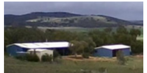
Moonshill, suitable for a pottery studio

Jane Crick's pottery, Moonshill, 1 km to the east of Tarago consisting of 50 acres of land, 20 acres of which is remnant forest, and several sheds and a vintage rail Guards Van is for sale. It has magnificent views of the surrounding countryside. The main Colorbond shed, used as a studio, has a concrete base and a veranda. It is divided into two with a workshop area and the other half carpeted and lined. It also has a slow combustion wood heater, LPG stove and fridge. The second large shed was used as a kiln shed and has an enclosed storage area with a concrete base. There is also a smaller shed with a concrete base, which was used as a gallery. The Guards Van has a bedroom, living area, study, toilet, and a large storage area. It requires further work to bring it up to scratch. The asking price is $285,000. For more details or EOI, please contact Ian Crick on 62812594 or by email: crickian@gmail.com