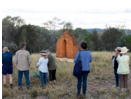
Nina Hole, Fire Sculpture, 1995