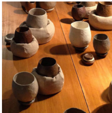
Pieces from Raw Verse, 2016.